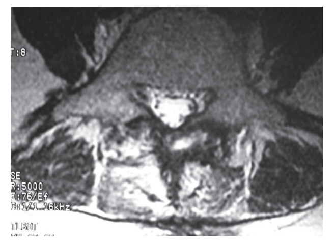
Fig. 4. Postoperative magnetic resonance image of a patient in the conventional group. The spinous process was excised and high signal change was observed in the paravertebral muscle, 3 months after surgery.

<sup>a)</sup>Determined by the Mann-Whitney U test.