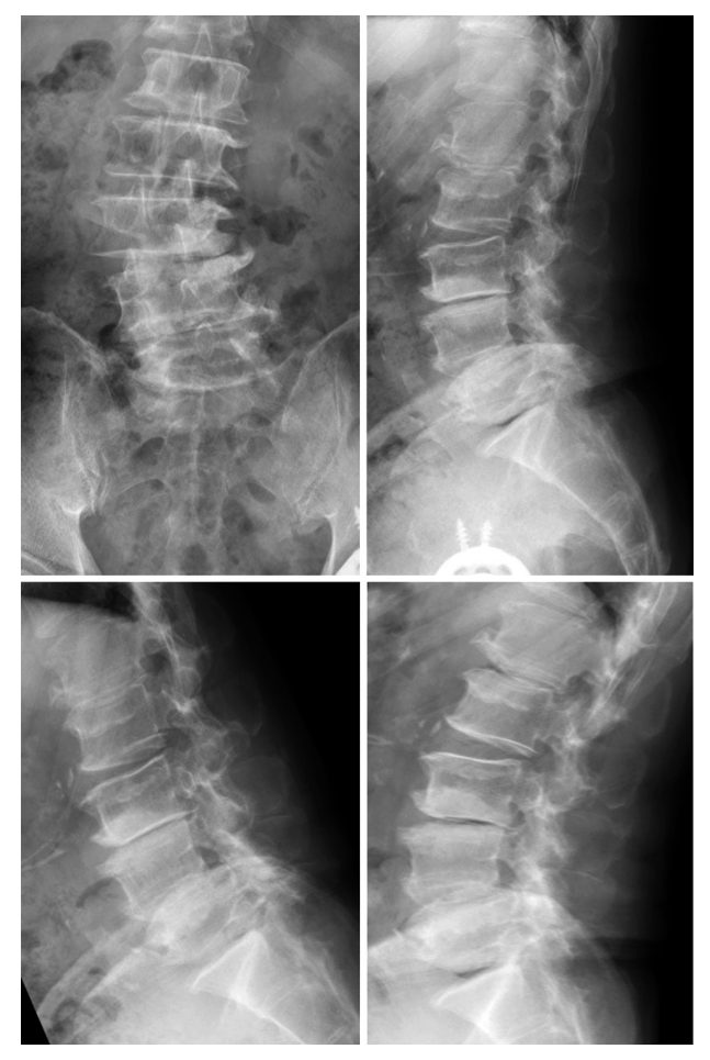
Fig. 1. Preoperative radiographs.