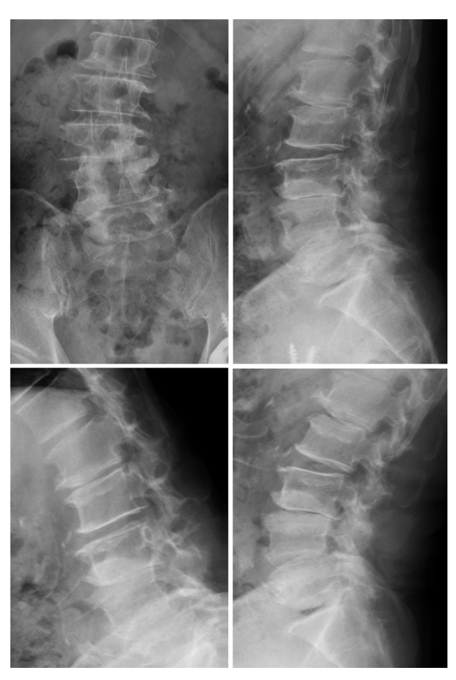
Fig. 2. Radiographs 2 years after the surgery. Spinous process-splitting laminectomy from L3 to L5 was performed. There was no spinal instability 2 years after the surgery. The Japanese Orthopaedic Association score improved from 9 to 22 points.