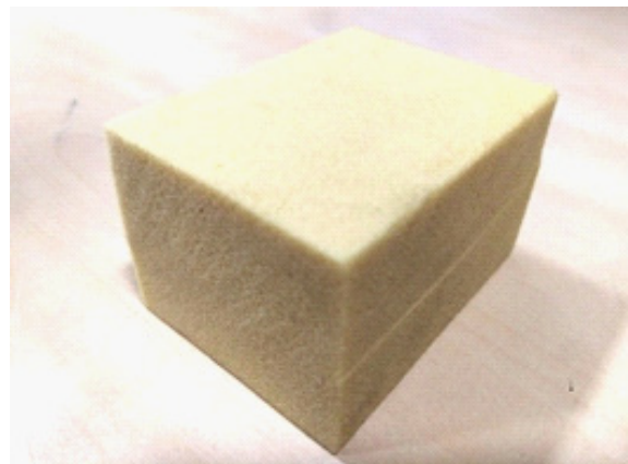
Fig. 1. Rigid polyurethane foam with 300 kg/m 3 density.

Training data for the model was incorporated into an experimental table that was built using L32 orthogonal array consisting of four factors—density, insertion depth, insertion angle, and reinsertion (Table 1). Input dataset consisted of 48 data points as per the Taguchi L32 Design of Experiments.