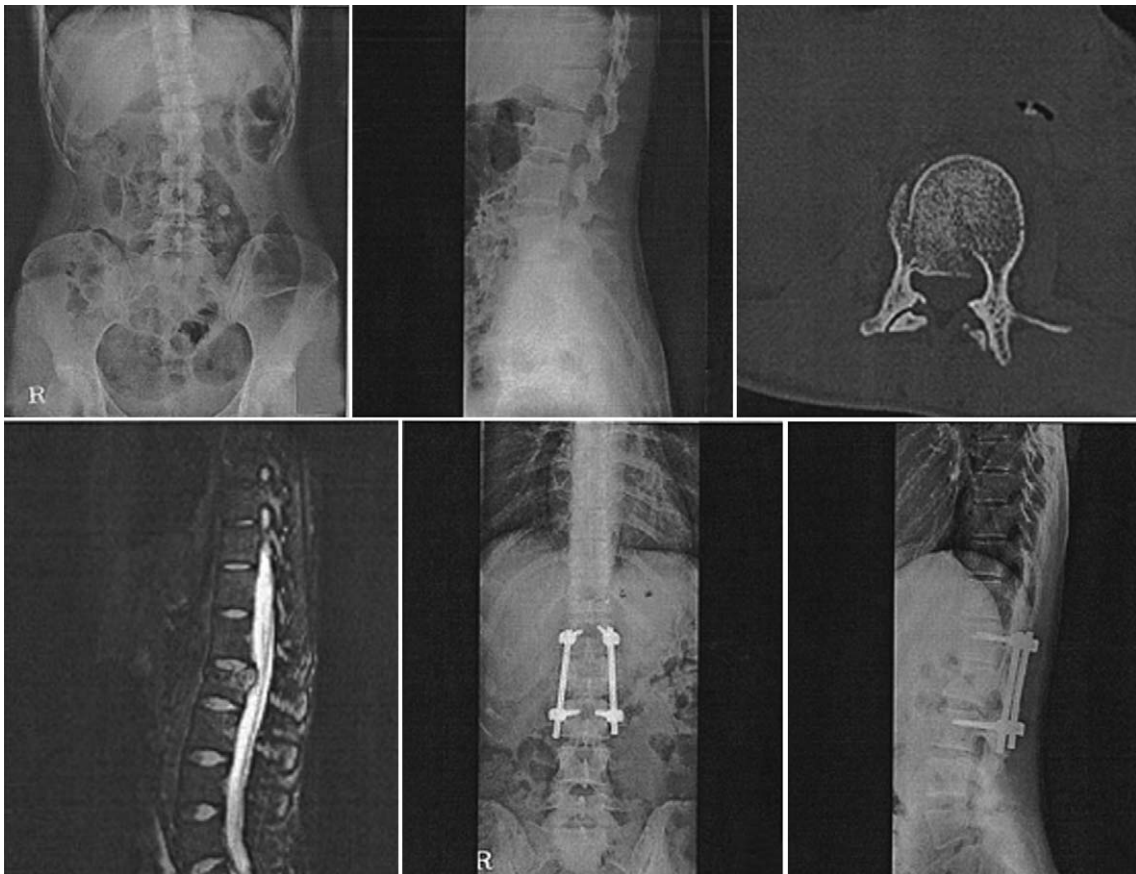
Fig. 3. A neurologically intact patient (0 point) with compression injury of L2 vertebral body (1 point) with burst component (1 point) and intact posterior ligamentous complex (0 point). Total score was 2, thus treatment recommendation is non-surgical treatment. But, about 40% canal compromise with kyphotic deformity was seen and we treated this patient with surgery.

Vaccaro et al. [22] in 2005 suggested a new classification method, the Thoracolumbar Injury Severity Score (TLISS) and this would compensate for the problems of the previous classification systems and satisfy the requirements of an ideal classification system. This classification scores three variables that are considered to be directly associated with the stability of the vertebral body and the prognosis. These variables are composed of the mechanism of injury as deter-