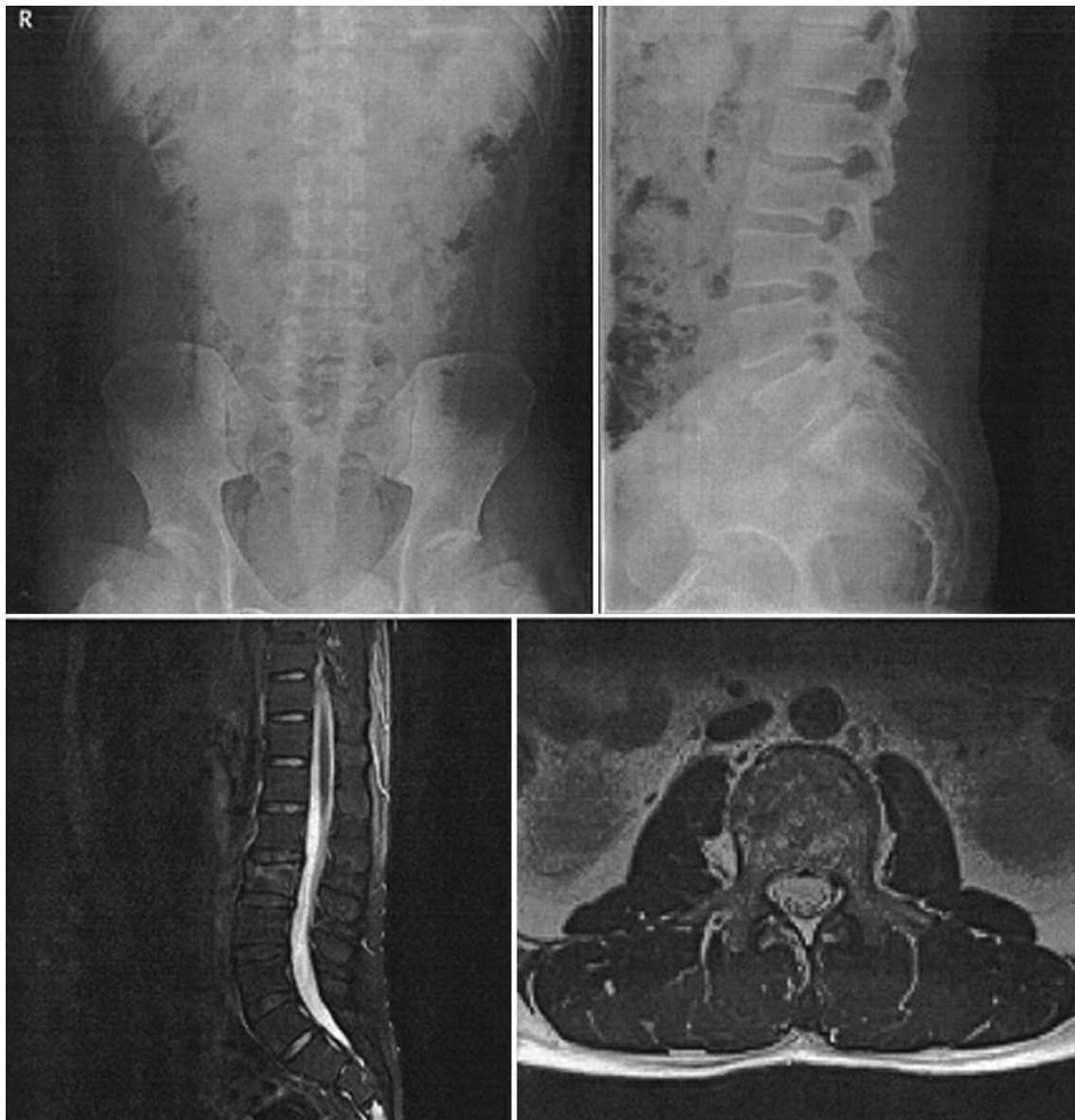
Fig. 1. A neurologically intact patient (0 point) with compression fracture (1 point) and intact posterior ligamentous complex (0 point). Total score was 1, thus treatment recommendation is non-surgical treatment.

Afterward, the intrarater reliability, as well as the interrater reliability of the score for each variable and sum, were evaluated by Cohen's unweighted k -value and Spearman's rank order correlation. For the statistical distinction of the Kappa values, the distinction according to the guideline of Viera and Garrett [13] was applied (Table 3). In addition, the sensitivity and specificity were evaluated by the percent of correct treatment protocols according to the sum of the TLICS and the treatment actually performed on the patients. The validity of selecting treatment protocols according to this classification was also assessed. SPSS ver. 13.0 (SPSS