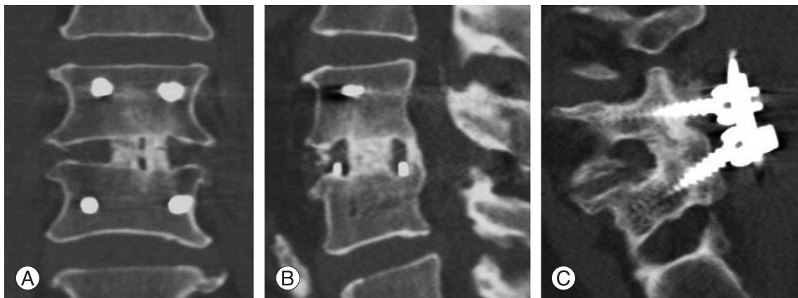
Fig. 3. Solid fusion is radiographically demonstrated on the sagittal and coronal computed tomography images. (A) There is continuous bony incorporation within and around the cage, (B) new bone formation at the posterior margin of the interbody space and (C) a fused posterior facet joint.

Postoperative wound infection was defined as a deep infection requiring additional surgery such as debridement. Postoperative motor deficit was identified as a manual muscle strength test with a score \leq 4 on a scale of 0 to 5. Adjacent segment disease was designated as a condition that required additional surgery for the treatment of symptoms refractory to non-operative treatment such as medication,